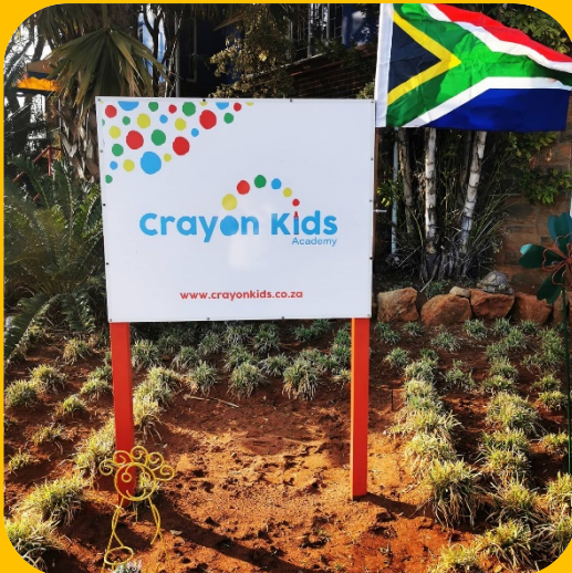
Heritage braai celebrations.